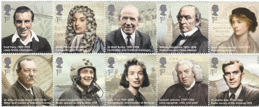
Royal Mail stamp set 'Eminent Britons', featuring Martin Ryle