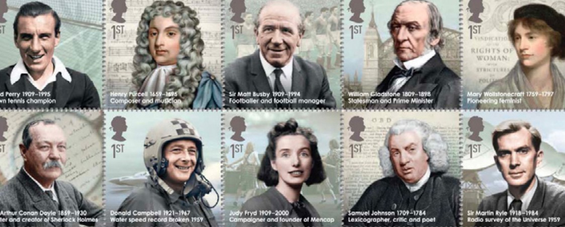
The 'Eminent Britons' Royal Mail stamp set, featuring Martin Ryle