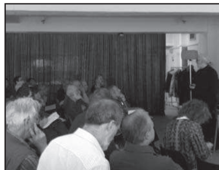
Questions from the floor